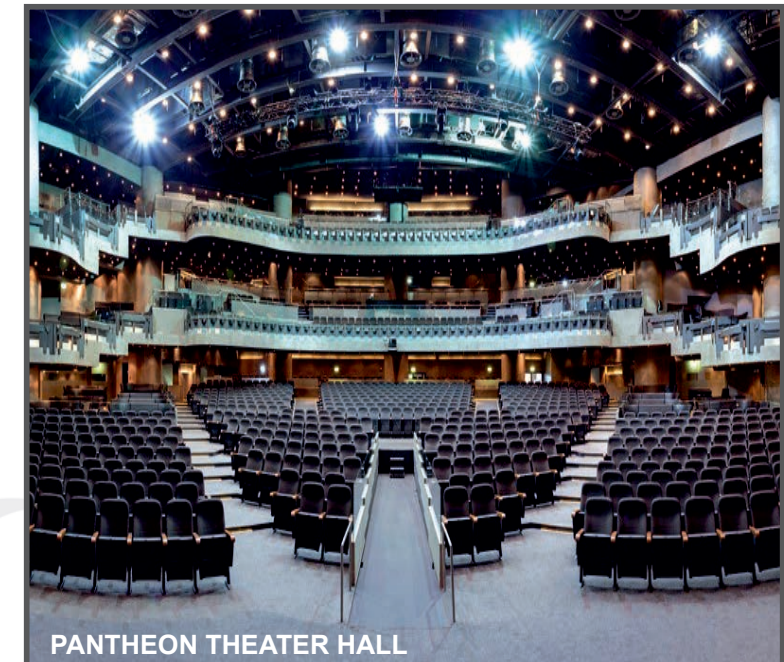
PANTHEON THEATER HALL

Adress: Basp nar OSB Mah. 5. Bolge 83528 Nolu Cad. No:4/1 Seh tkam I 27620 GAZIANTEP TURKEY