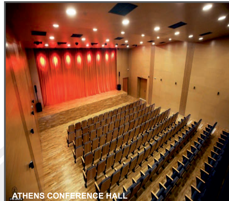
ATHENS CONFERENCE HALL