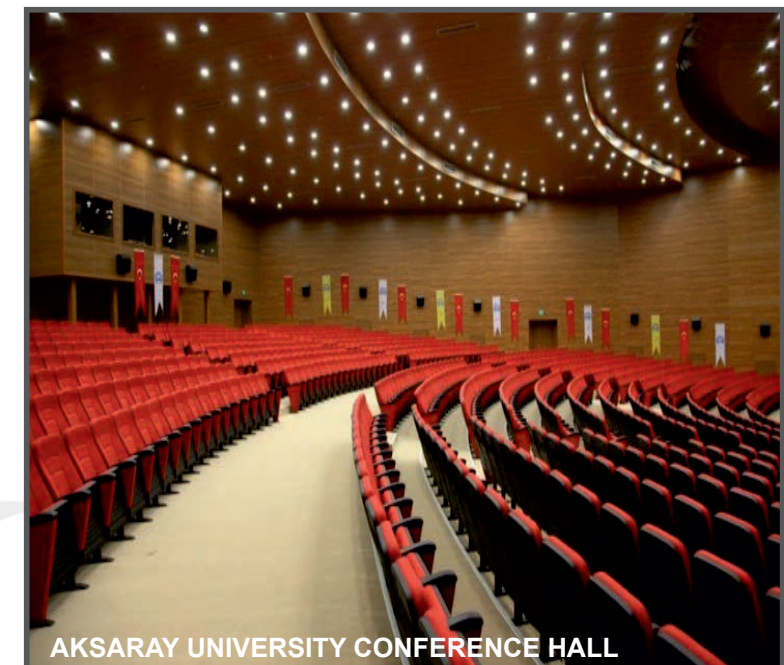
AKSARAY UNIVERSITY CONFERENCE HALL

Address: Basp nar OSB Mah. 5. Bolge 83528 Nolu Cad. No:4/1 Seh tkam I 27620 GAZIANTEP TURKEY