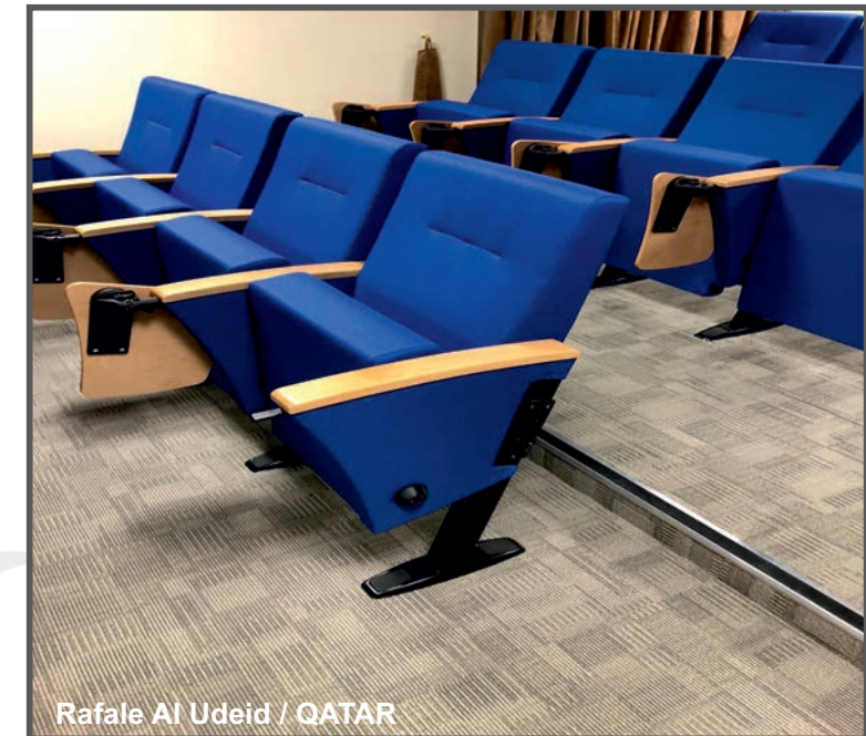
Rafale Al Udeid / QATAR

Adress: Basp nar OSB Mah. 5. Bolge 83528 Nolu Cad. No:4/1 Seh tkam I 27620 GAZIANTEP TURKEY