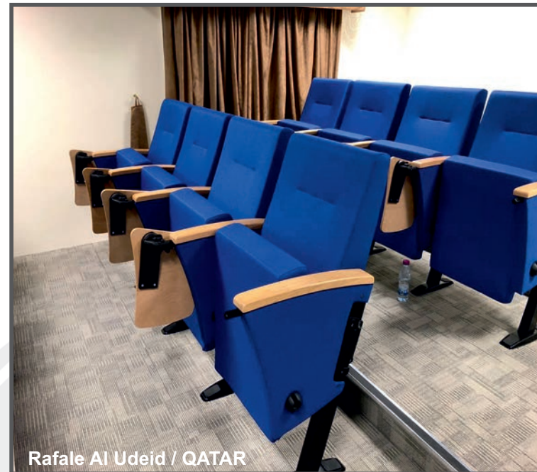
Rafale Al Udeid / QATAR