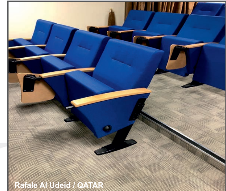
Rafale Al Udeid / QATAR

Address: Basp nar OSB Mah. 5. Bolge 83528 Nolu Cad. No:4/1 Seh tkam I 27620 GAZIANTEP TURKEY