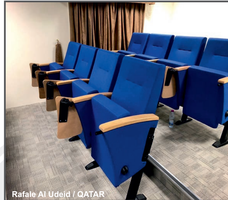
Rafale Al Udeid / QATAR