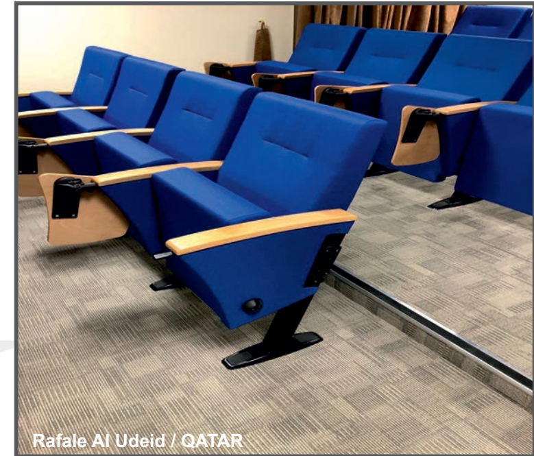
Rafale Al Udeid / QATAR

Address: Basp nar OSB Mah. 5. Bolge 83528 Nolu Cad. No:4/1 Seh tkam I 27620 GAZIANTEP TURKEY