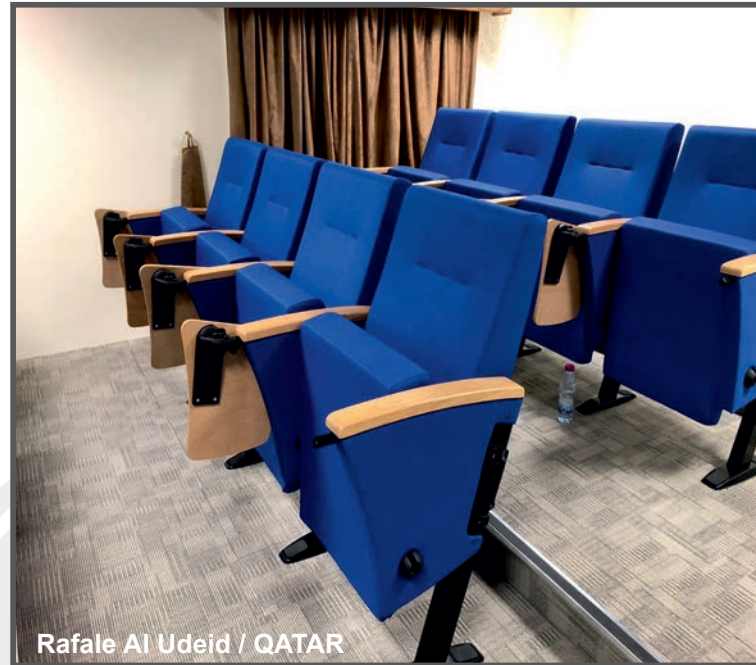
Rafale Al Udeid / QATAR